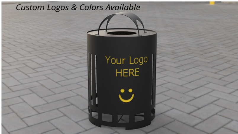
Custom Logos & Colors Available